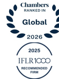
Chambers RANKED IN Global 2026