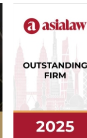
asialaw OUTSTANDING FIRM 2025