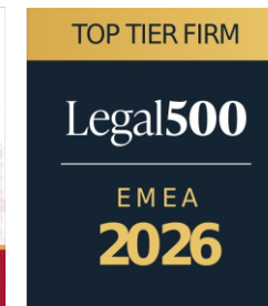
TOP TIER FIRM Legal500 EMEA 2026