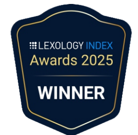
LEXOLOGY INDEX Awards 2025 WINNER